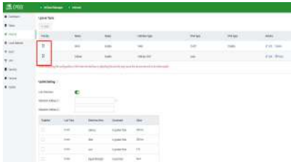
5G + Broadband Backup

With automatic failover and load balancing, you can easily build redundancy and backup systems to minimize single points of failure for seamless service continuity and minimal downtime.